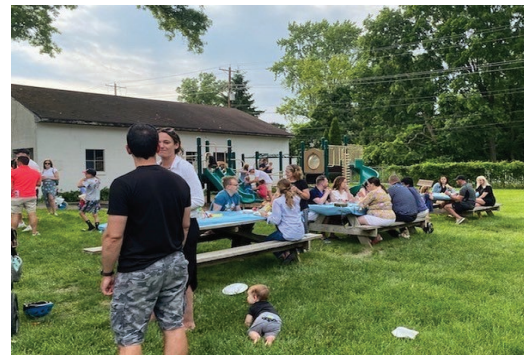
On Saturday, recently married and engaged IC couples and Marriage Mentor couples gathered for a Couples Cookout in the green space and enjoyed food, games, and community.

"For where your treasure is, there will your heart be also." – Matthew 6:21