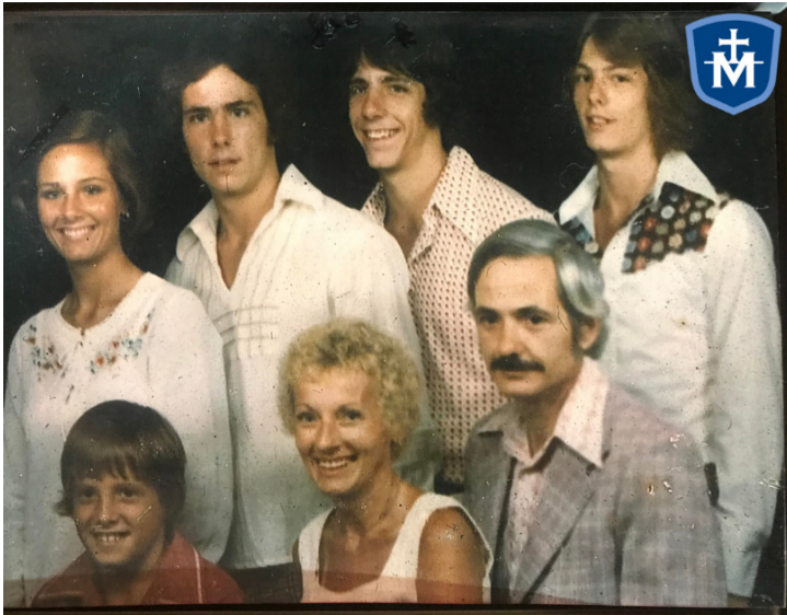
Bruzzese Family LEGACY FAMILY SPONSOR